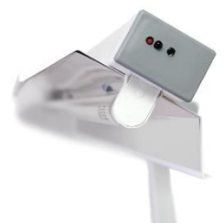
Digital counter with acoustic signalling, without the display